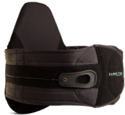
Horizon 631 LSO Flexion and extension motion support Postoperative support for sore muscles Code L0631 approved