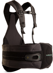
Horizon 456 TLSO Height adjustment technology Wide circumference range Code L0456 approved