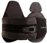
Horizon 639 LSO Overlapping lateral and anterior panels Additional anterior height Code L0639 approved