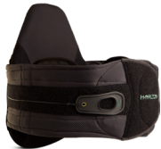
Horizon 637 LSO Flexion and extension support with lateral control Integrated anterior support Code L0637 approved